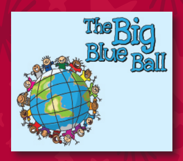
November 9-12, 2016