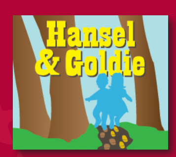
May 10-13, 2017