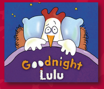
February 8-11, 2017