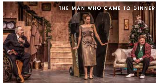
THE MAN WHO CAME TO DINNER