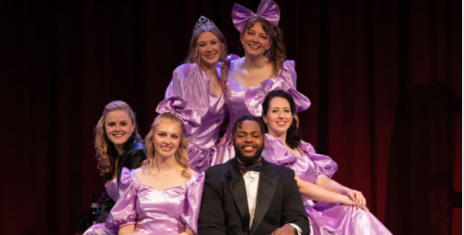
5 WOMEN WEARING THE SAME DRESS