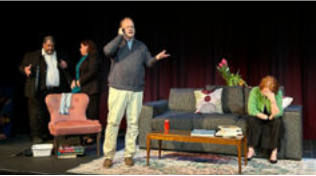
GOD OF CARNAGE : May 1 – 4, 2025