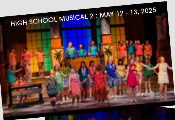
HIGH SCHOOL MUSICAL 2 : MAY 12 - 13, 2025

The mission of Sunset’s School for the Arts is to provide programs that enable young people to acquire knowledge and skills in the performing arts, as well as gain lifelong interest in arts and culture. The School for the Arts offers weekly classes for all children ages 2 – 18, specialty workshops, performing arts camps, and two fully-staged junior musicals.