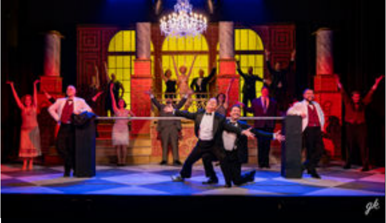
GRAND HOTEL : April 24 – May 11, 2025