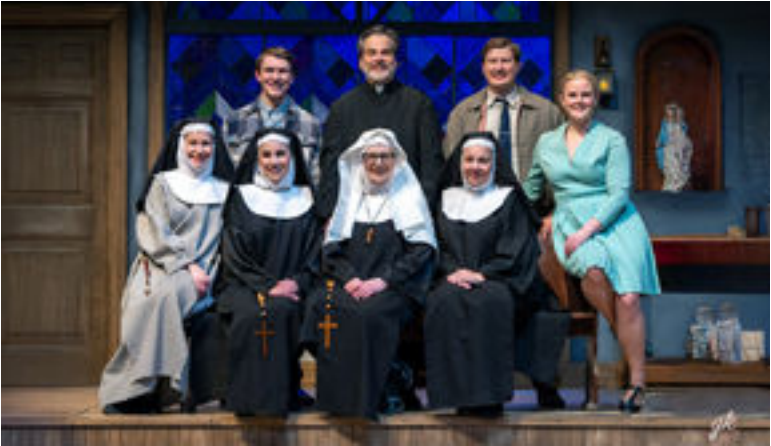
DRINKING HABITS : March 6 – 23, 2025