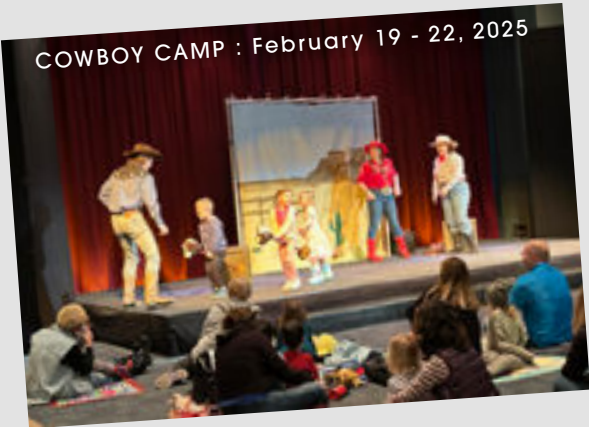
COWBOY CAMP : February 19 - 22, 2025

A three-show series produced by the School for the Arts. In addition to in-house performances, Sunset’s bug in a rug productions tour area elementary schools, preschools, libraries, and community centers where thousands of children experience—many for the first time—the joy of live theater.