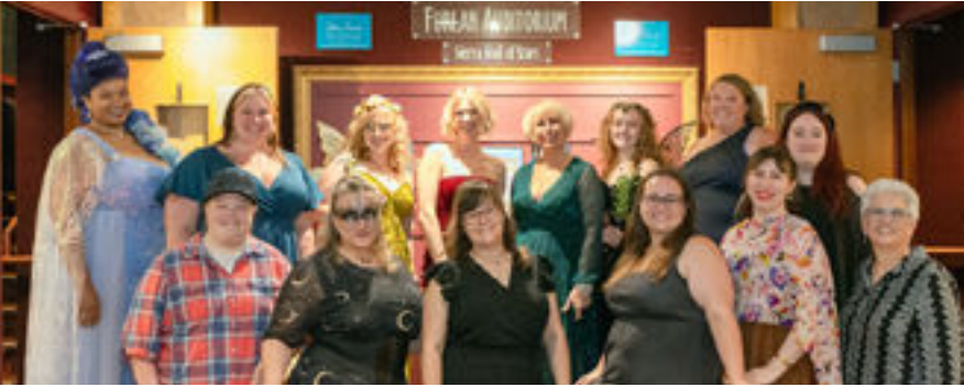
SUNSET STAFF : VOLUNTEER APPRECIATION NIGHT : August 16, 2025