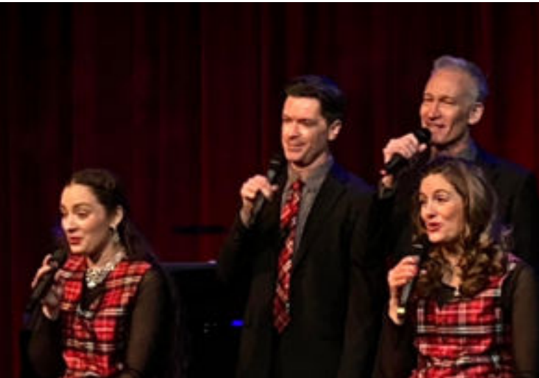
MERRY & BRIGHT | Dec. 5-8, 2024 | SideNotes Cabaret

Sunset Playhouse acknowledges the individuals, corporations & foundations whose generosity confirms the importance of live theater in our community. In recognition of this support & encouragement, we proudly list their names in thanks. This list reflects those who donated to Sunset Playhouse from September 1, 2024 to August 31, 2025. To donate to our Celebration of Giving, please visit SunsetPlayhouse.com .