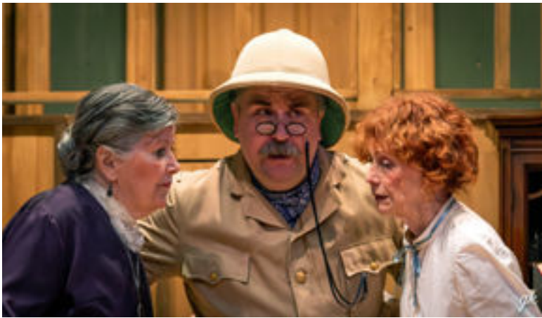
ARSENIC AND OLD LACE : September 5 - 22, 2024