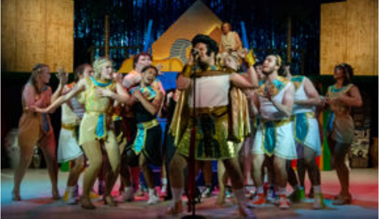
JOSEPH AND THE AMAZING TECHNICOLOR DREAMCOAT : July 10 – Aug 3, 2025