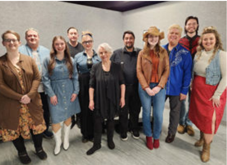
'90s COUNTRY TRIBUTE | Jan. 20-21, 2025 | Musical MainStage