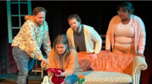
TINY BEAUTIFUL THINGS : January 23 – 26, 2025