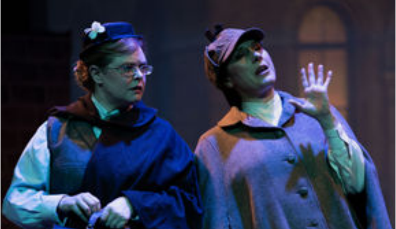
MISS HOLMES : June 5 – 22, 2025