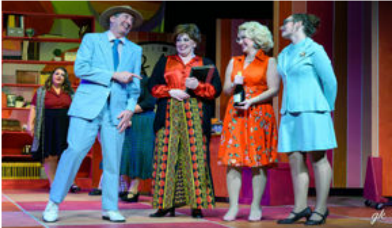
9 TO 5 : October 17 - November 3, 2024