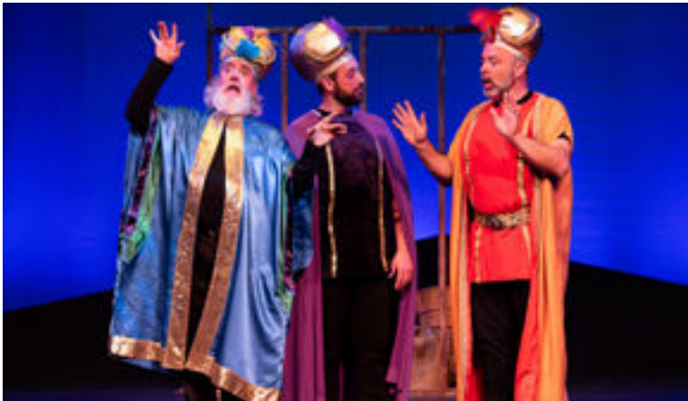
'TWAS THE MONTH BEFORE CHRISTMAS : Dec 5 - 22, 2024