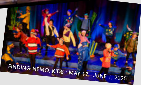
FINDING NEMO, KIDS : MAY 17 - JUNE 1, 2025

A three-show series produced by the School for the Arts. In addition to in-house performances, Sunset’s bug in a rug productions tour area elementary schools, preschools, libraries, and community centers where thousands of children experience—many for the first time—the joy of live theater.