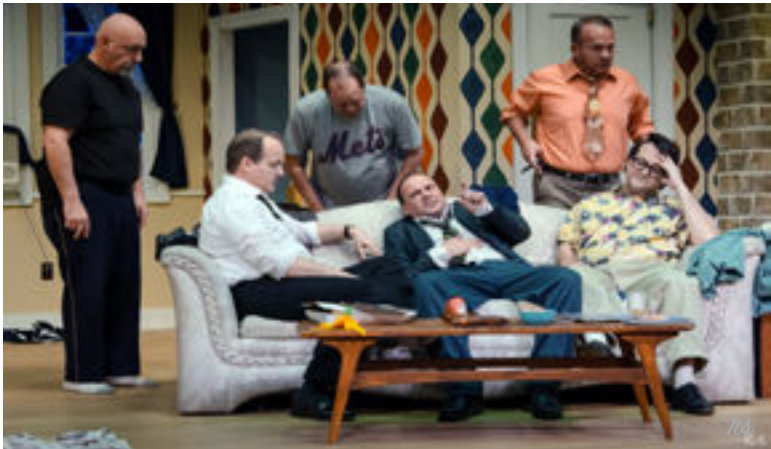
THE ODD COUPLE : January 16 - February 2, 2025